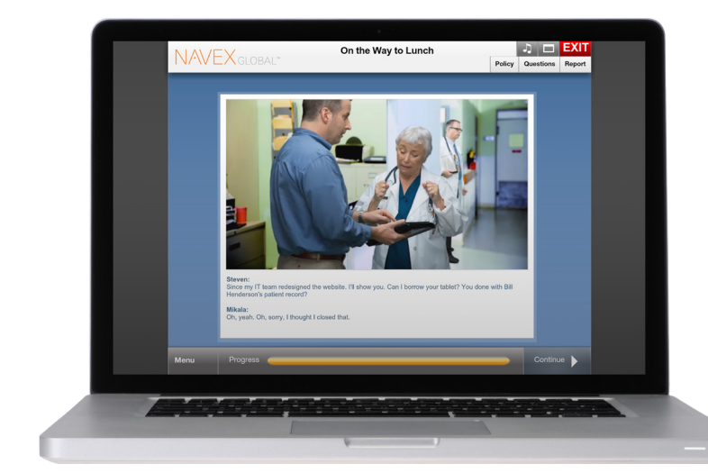
Fig. 1-0 An employee inadvertently reveals protected health information (PHI) to a colleague.