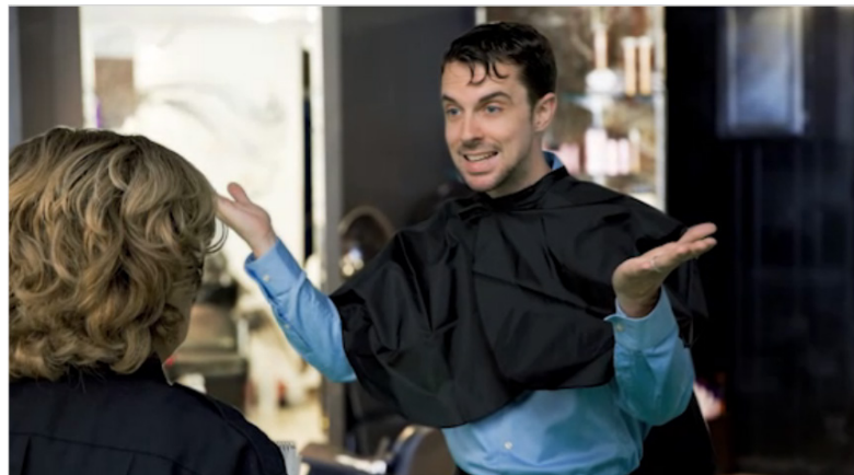
Fig. 2-0 An employee inadvertently reveals PHI to a colleague.

Policewoman: Fortunately, those things are easily replaced.